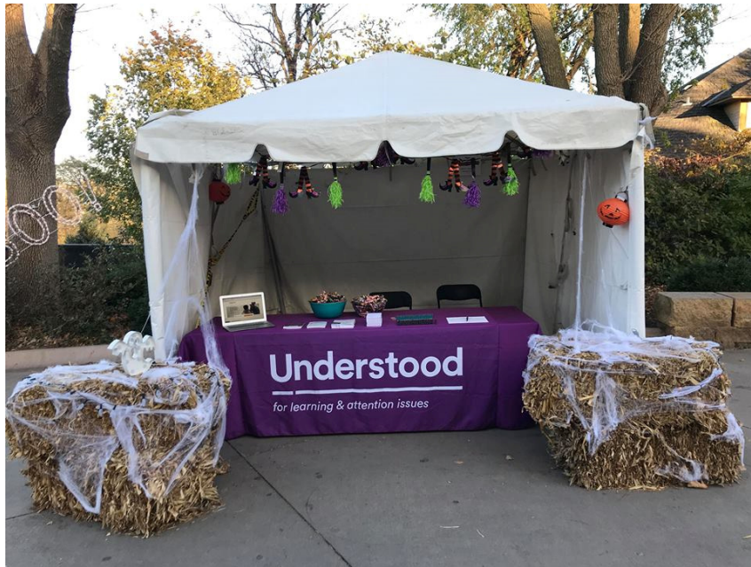
Boo at the Zoo, Omaha